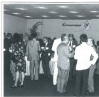
Media reception prior to the press conference on the announcement of the awards.