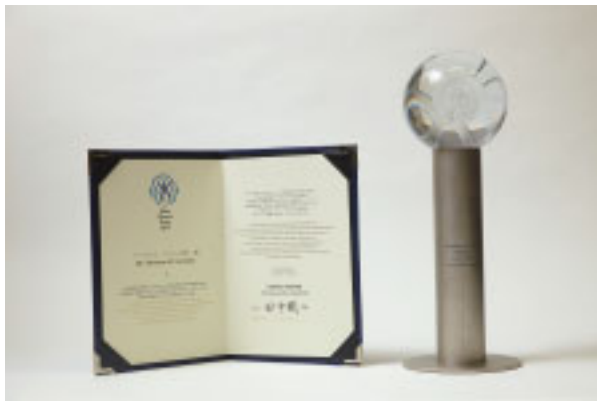
The Blue Planet Prize Trophy and Certificate

At the Asahi Glass Foundation, we hope that people around the world will work toward protecting our planet from destruction, ensuring our treasured inheritance continues to exist for future generations.