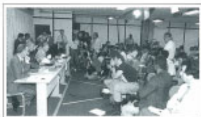
Press conference at the Earth Summit in Rio de Janeiro.